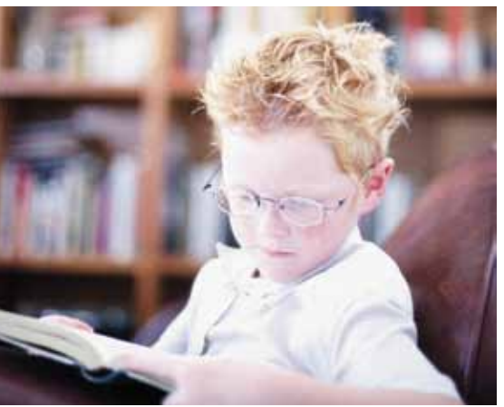
Copyright © State of Victoria, Australia. Reproduced with permission of the Secretary of the Department of Human Services. Unauthorised reproduction and other uses comprised in the copyright are prohibited without permission.